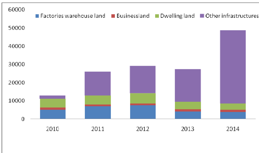
Figure 2. Supply change of state-owned construction land from 2010 to 2014