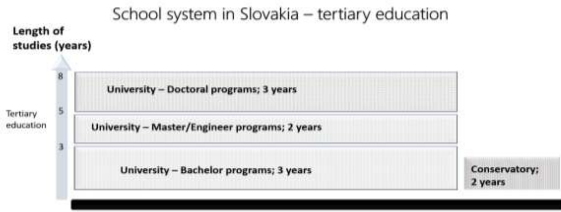
Graph 2: Tertiary education in Slovakia